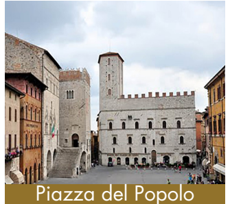
Piazza del Popolo

Piazza del Popolo: This inviting public square has been in use since before Roman times. It is one of the largest Medieval spaces in Italy, and is still used for a variety of performances and events.