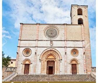
S. Maria Annunziata